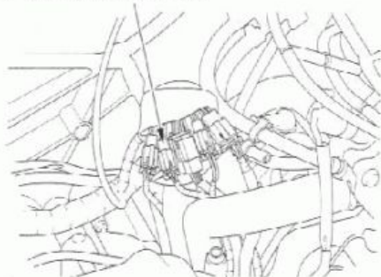
3P GREEN CONNECTOR

Check for continuity between the wire terminals of the side stand switch connector. Continuity should exist only when the side stand is up.