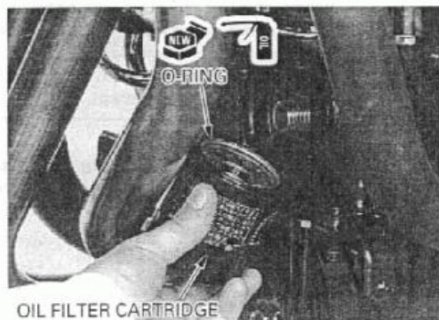
OIL FILTER CARTRIDGE

Install the new oil filter and tighten it to the specified torque.