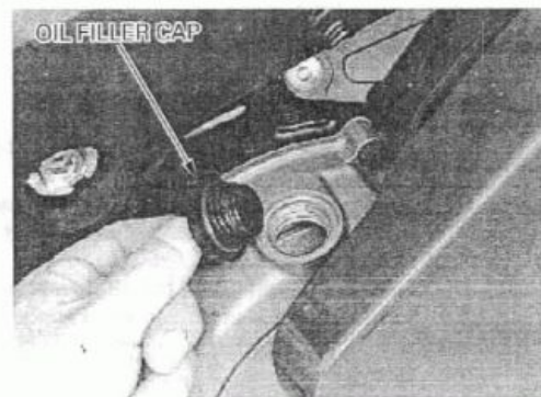
OIL FILLER CAP

Start the engine and let it idle for 2 to 3 minutes. Stop the engine and recheck the oil level. Make sure there are no oil leaks.