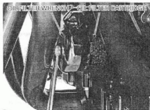
OIL FILTER WRENCH OIL FILTER CARTRIDGE

Fill the crankcase with the recommended engine oil.