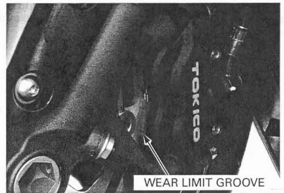
WEAR LIMIT GROOVE

Check the brake pads for wear. Replace the brake pads if either pad is worn to the bottom of wear limit groove. Refer to brake pad replacement (page 16-11).