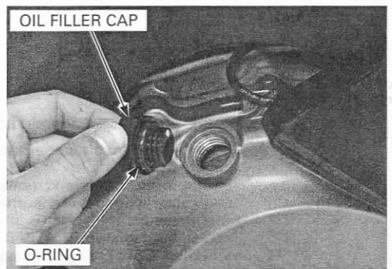
OIL FILLER CAP