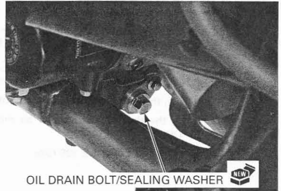
OIL DRAIN BOLT/SEALING WASHER

Apply clean engine oil to the oil filter cartridge threads and new O-ring.