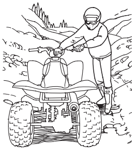
Be sure your legs are clear of the wheels.

If the hill is not too steep and you have good footing, you may be able to walk the ATV back down the hill. Make sure your intended path is clear in case you lose control of the ATV.