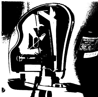
(1) Document compartment